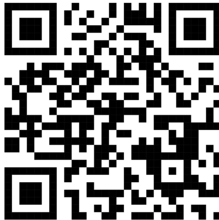
Student rights and duties regulation at Shaqra University

Student rights and duties regulation at Shaqra University are available at the following barcode: