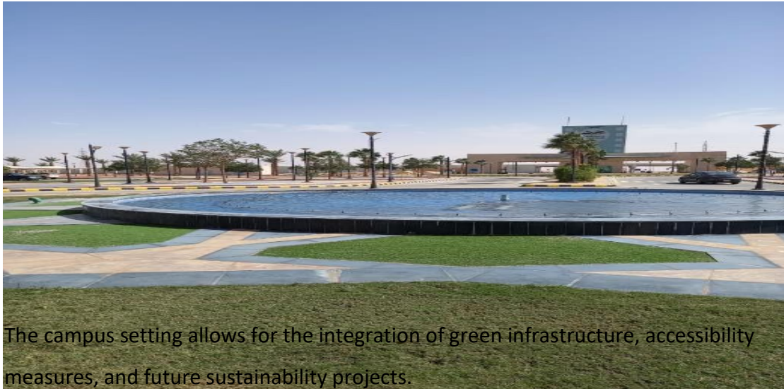
The campus setting allows for the integration of green infrastructure, accessibility measures, and future sustainability projects.

This location allows for sustainable expansion and the integration of green spaces and infrastructure, aligning with the university’s environmental goals and Saudi Vision 2030.