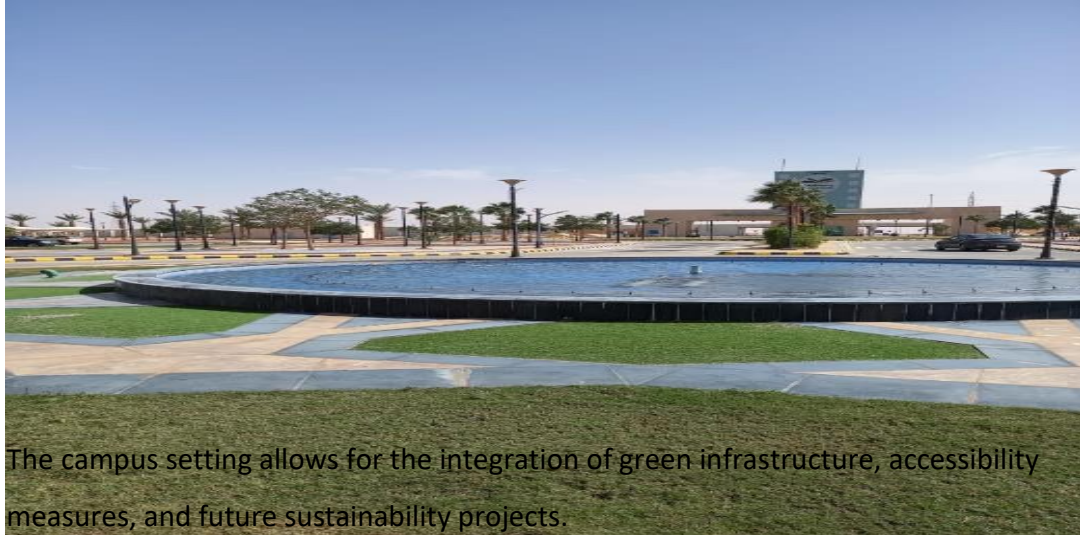
The campus setting allows for the integration of green infrastructure, accessibility measures, and future sustainability projects.

This location allows for sustainable expansion and the integration of green spaces and infrastructure, aligning with the university’s environmental goals and Saudi Vision 2030.